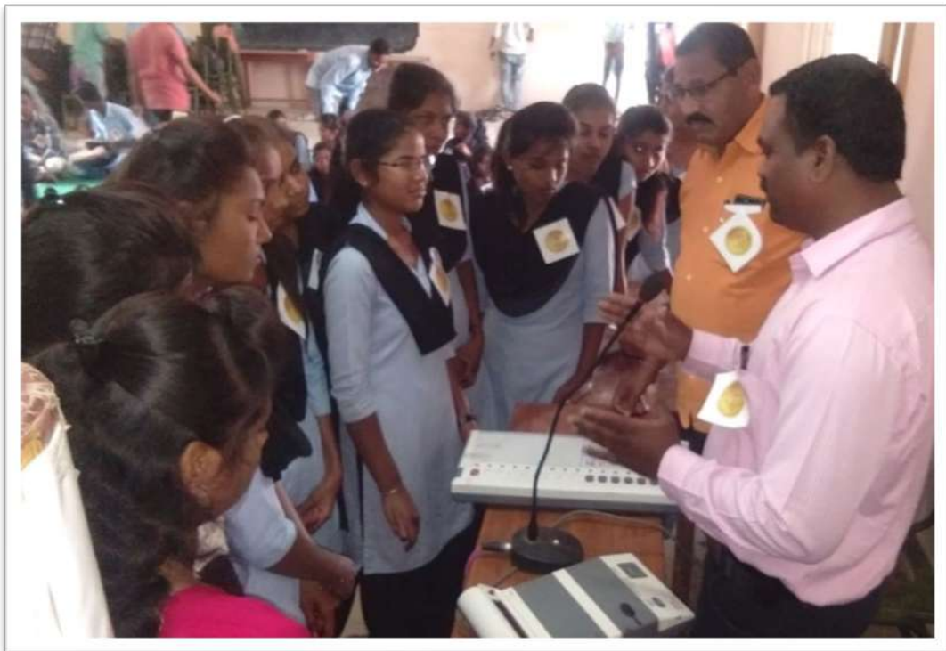
Demonstration of Voting Machine with students