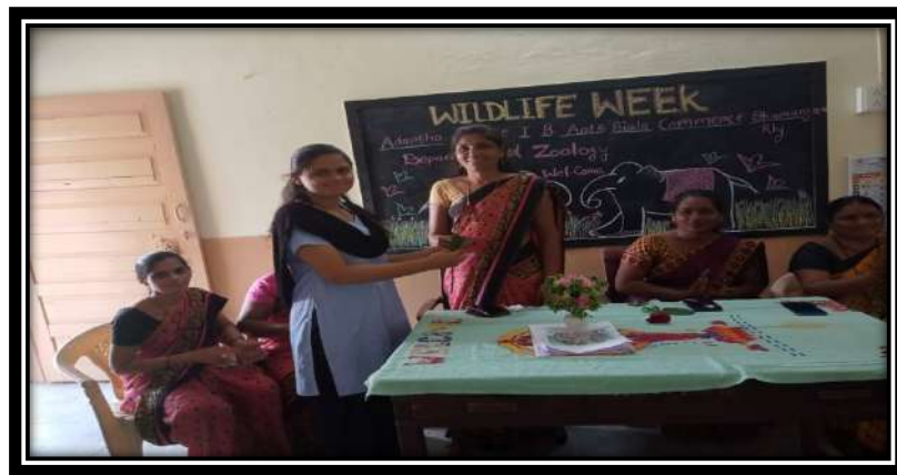
WILDLIFE WEEK: 2021 CELEBRATION AT DR. BABASAHEB AMBEDKAR SCHOOL ON 04.10.2021