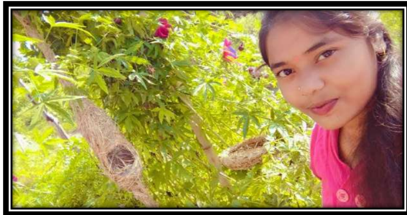
SELFIE WHILE INSTALLING BIRD NEST ON 06.10.2022