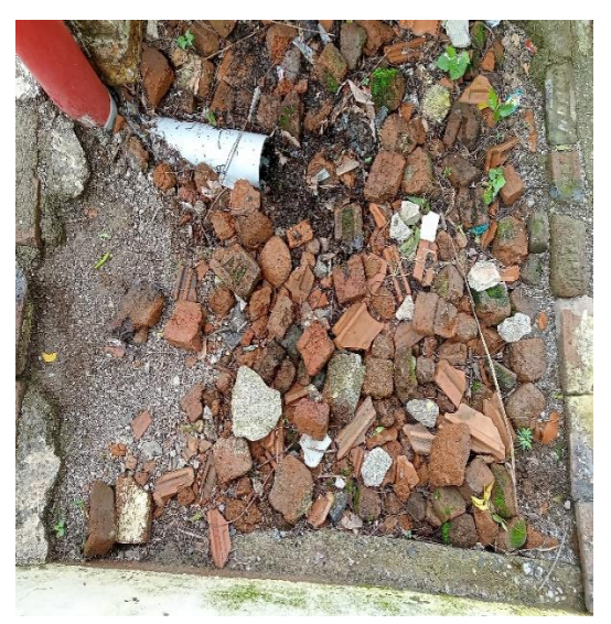
RAIN WATER HARWESTING PIT